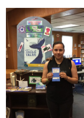
Weeks 9 & 10 Winners